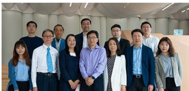
Bismuth Cure for COVID-19 Hong Kong